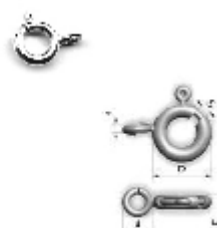
S.AM.00006 SPRING-RINGS 6MM g: 0,179