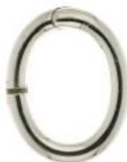
S.CHS.00003 HOLLOW TUBE CLAPS g: 1,80