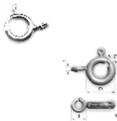
S.AM.00008 SPRING-RINGS 8MM g: 0,40