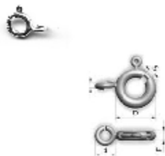
S.AM.00005 SPRING-RINGS 5MM g: 0,13