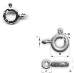
S.AM.00007 SPRING-RINGS 7MM g: 0,26